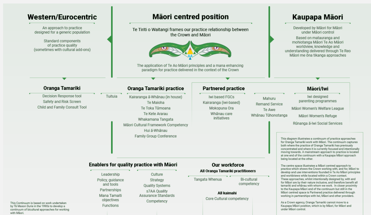
Figure 2 Continuum of practice approaches for working with Māori (Oranga Tamariki Practice Centre, 2021).

Oranga Tamariki is currently working to create an organisational shift towards Māori-centred practice to better respond to its obligations to Te Tiriti o Waitangi and Section 7AA requirements. A Māori-centred approach encourages practice within a Tauwi-Crown context that responds to, and resonates with Māori, as Māori. It sits in the middle of the spectrum between Western approaches (on one end) and Kaupapa Māori approaches (on the other). See Figure 2.